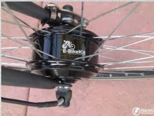
Hub Motor in Wheel