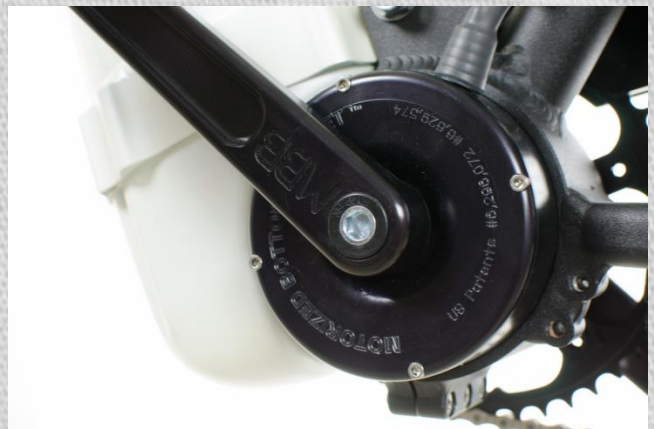
Patented Optibike MBB Hill Climbing Champion.